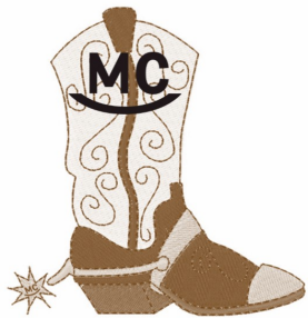
Miles City Walking Path