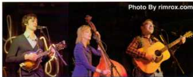
Song Dog Serenade