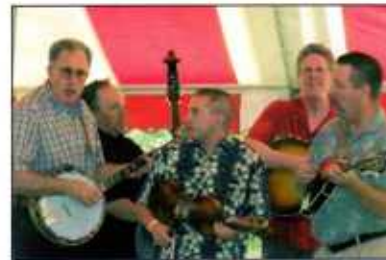
High Plains Tradition