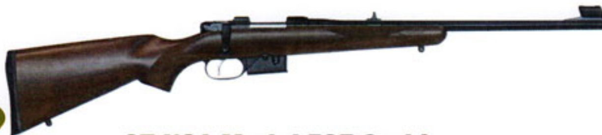
CZ-USA Model 527 Carbine

Fish Races Gun Raffle Heads or Tails Game Door Prizes Live Auction Silent Auction Kids Games & Prizes