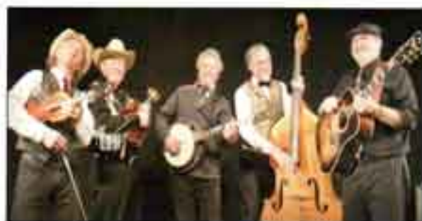
The Wood Picks

Tickets available for Musical Instrument Raffle