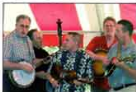
High Plains Tradition