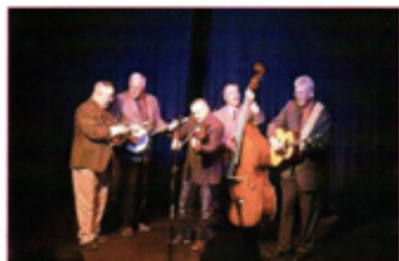
High Plains Tradition

for more information call (406) 234-2480 or (406) 853-1678