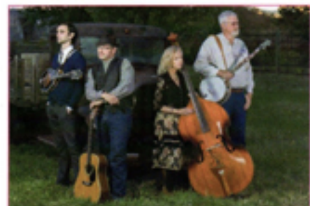
Song Dog Serenade