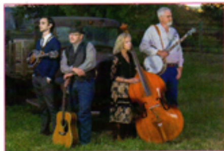
Song Dog Serenade