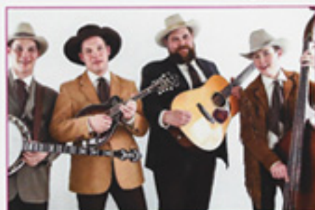
The Waddington Brothers