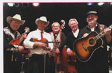
The Wood Picks