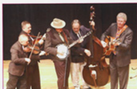
High Plains Tradition

for more information call (406) 234-2480 or (406) 853-1678