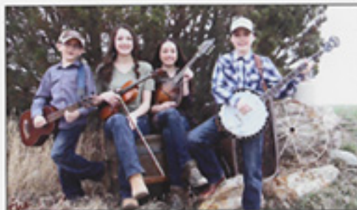
The Little Blue Stems