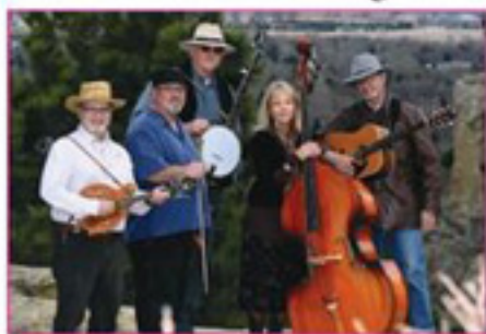
Song Dog Serenade