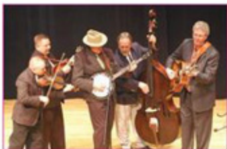
High Plains Tradition

For more information call (406) 234-2480 or (406) 853-1678