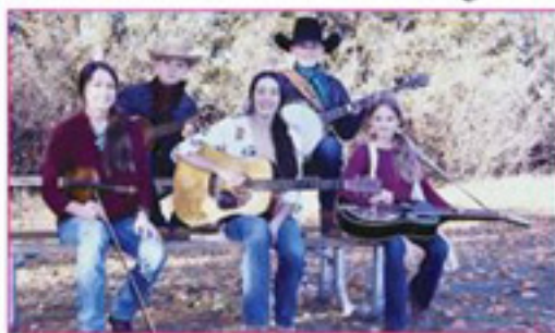
The Blue Stems