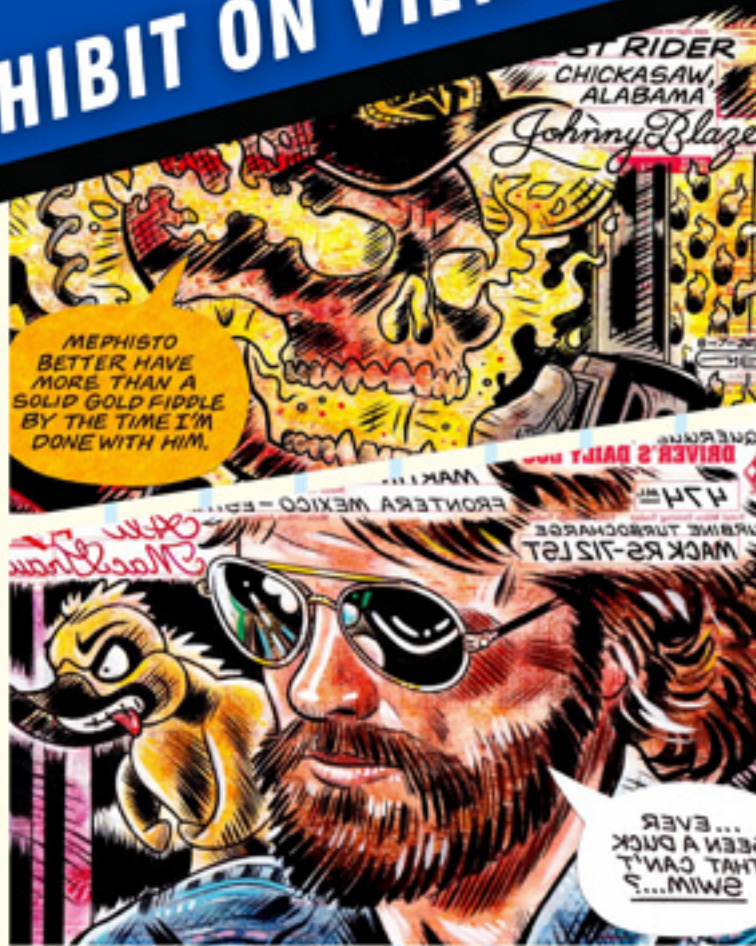
EXHIBIT ON VIEW OCTOBER 7 - NOVEMBER 10