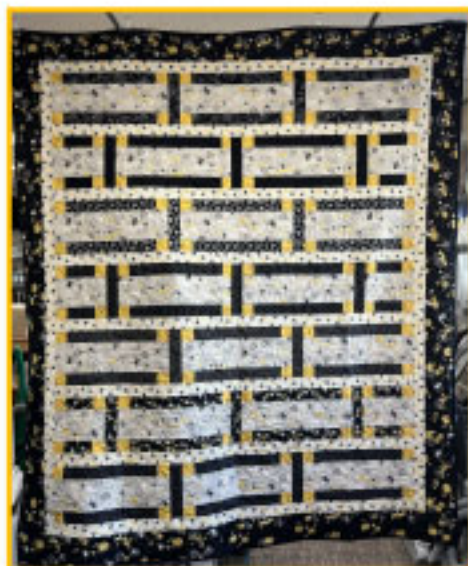
Quilt dimensions: 78" x 89"