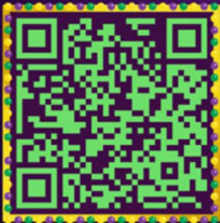
TRAINER 2024 NVP CATIE MCNEW - NE